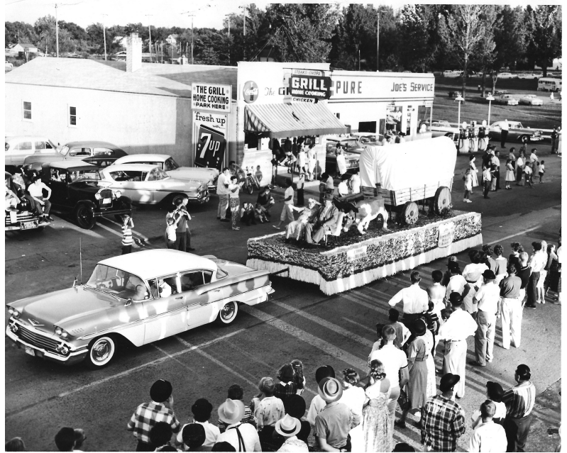
Old Timers Night parade featuring Grand Marshals Bill & Stella Rybak seated in front of wagon. Grill Restaurant & Joe's Service Station shown. No date available.

Refreshments will be served. Questions can be addressed to (651) 633-4070 or nbahs@me.com.